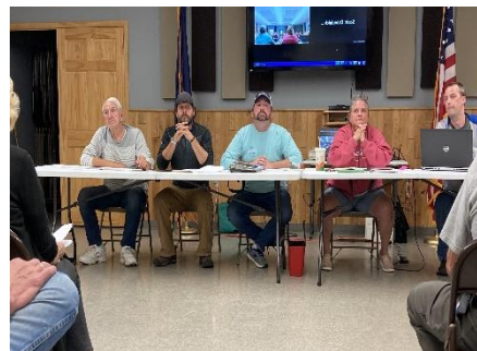
Township Board Meeting