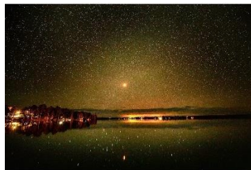
May "Blood Moon" over Lac la Belle