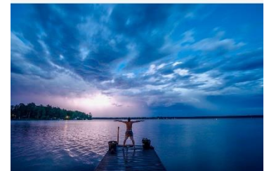
Celebrating a new day