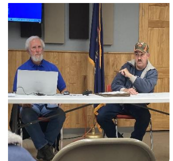
Union Park Planning Meeting