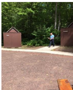
When you gotta go!