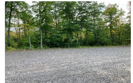
Union Park site

Can we do a Springtime trash pick-up along Lac la Belle roads?