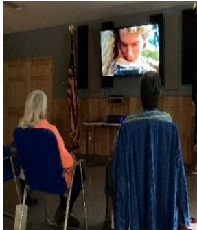
Movie Night featured "The Princess Bride"